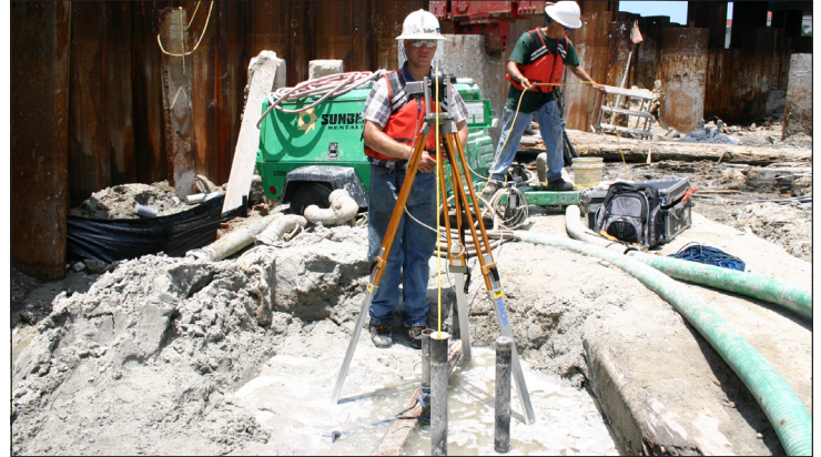
Thermal testing by probe method

Temperature measurements at the cage, obtained by either the Probe or Thermal Wire method, may also be used to evaluate concrete cover and cage alignment. The measured temperatures have an almost linear relationship to the concrete cover: if the cage is closer to one side of the excavation (less cover) its temperature is lower than average while sections closer to the shaft center will exhibit higher than average temperatures.