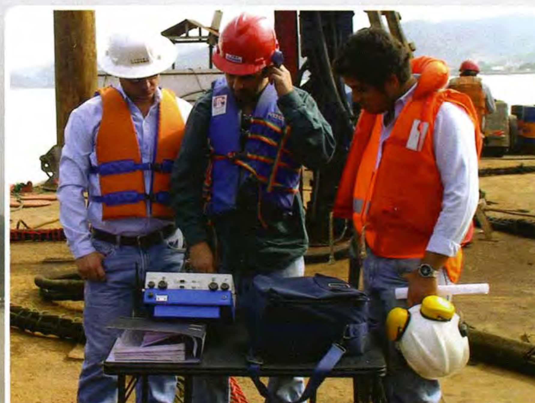
GRL engineers were contracted to perform test pile installations.