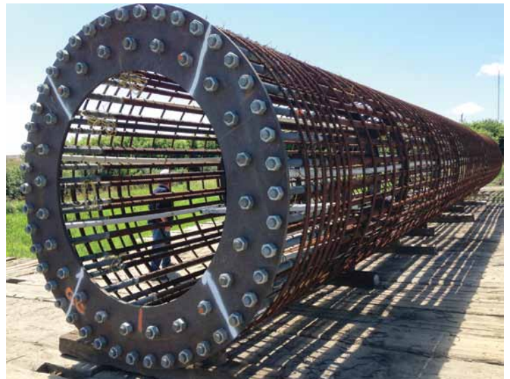
10 ft (3 m) Diameter Reinforcing Cage for Critical High Load Structure

Following successful integrity tests on the 5 critical structures, EC Source proposed and converted 79 additional structures from Cross-Hole Sonic Logging to Thermal Integrity Profiling. GRL is now performing TIP on 170 foundations on the project. Neil Russo, who played a key role in implementing TIP into the project, commented on his experience: "Due to the magnitude and scheduling challenges of these projects, TIP has proved to be an invaluable part of the successful completion of its foundations. TIP has allowed us the flexibility to speed up production and reduce the need for additional Non Destructive Testing suggested by CSL. EC Source will be marketing TIP as the sole preferred method of integrity testing for all future transmission line projects."