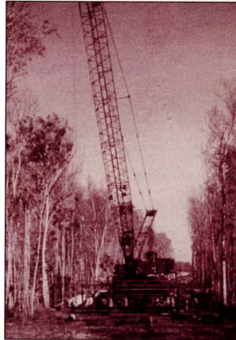
Site view of Bridge over Reedy Creek

The first pile in a bent was tested with the PDA during initial driving and after 30 minutes for a set-check. Driving of the test pile was finished after either reaching 3 m of penetration with required ultimate PDA capacity, or a refusal blow count.