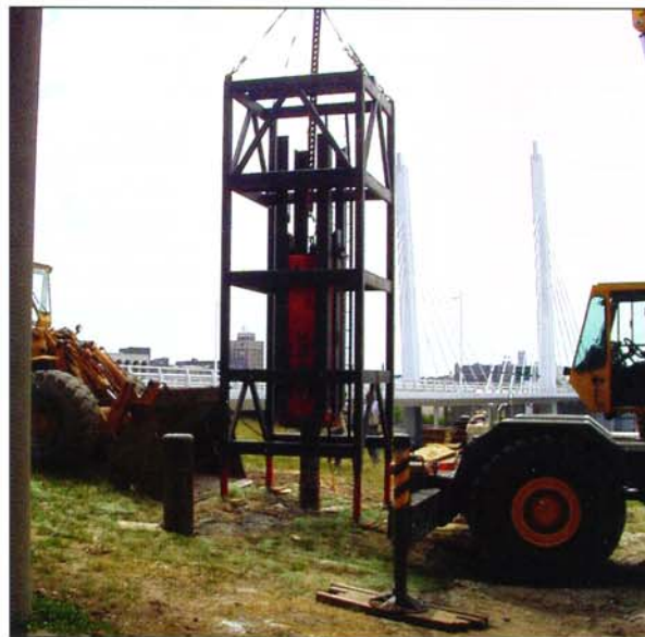
APPLE Testing near the 6th St. Viaduct

and dynamic testing during this extensive initial pile test program. Van Komurka conducted the internally instrumented static load tests, and Pat Hannigan was in charge of Pile Driving Analyzer ® testing and CAPWAP ® analyses. The team worked closely together to develop soil set-up vs. depth profiles for all 89 test piles. With this information, it will be possible during production pile driving to install the piles to end of drive capacities much smaller than required long-term, and to predict how much long-term capacity will be available as a result of set-up. Test-program capacity determinations indicate unit set-up of up to 239 kPa (5 ksf), and total set-up of up to 5338