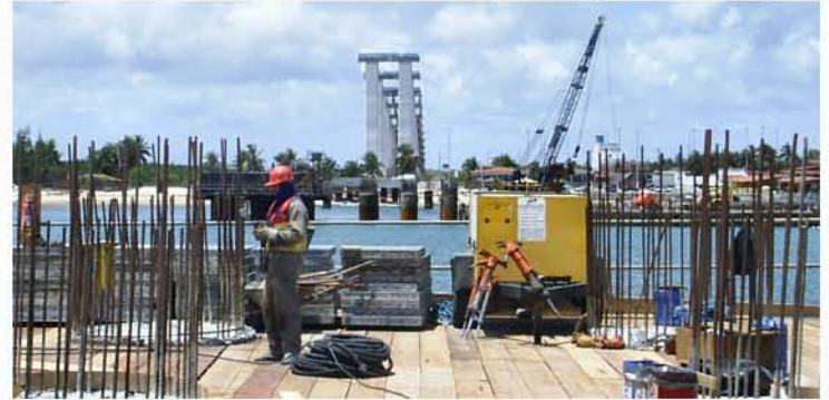
Drilled Shafts, bridge over Potengi River

The California office of GRL Engineers was retained to perform cross-hole sonic logging in Baja, Mexico. Anytime testing is required in locations that require airline transportation, recently imposed more stringent airline restrictions on baggage weight present a potential cost increase. GRL was able to avoid excess baggage fees and transfer the transportation cost savings to its client by offering the CSL service with a much lighter piece of equipment that does not exceed airline baggage weight limits.