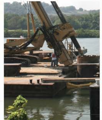
Blennerhassett Island Bridge, mid river shaft

Certainly the most challenging of the projects was the Blennerhassett Island Bridge over the Ohio River (side note for American history students: this island was made infamous by Aaron Burr). This bridge is supported by 10.7 m (35 ft) long 2.3 m (7.5 ft) diameter drilled shafts that were drilled from a barge and included access tubes for CSL testing. In the river piers, the top of the concrete was 9 m (30 ft) below water level, at the river bottom, and steel shells rose 12 m (40 ft) above the concrete to provide access for construction and testing. Six access tubes were installed in each of the shafts. The only way to perform the CSL test was from a 1 m by 1 m (3 ft by 3 ft) basket that was lowered into the shafts. Engineers from the GRL Ohio office carried the CHAMP as they rode in the basket. They welcomed the low weight of the instrument and the fact that it had sufficient battery life for the entire test.