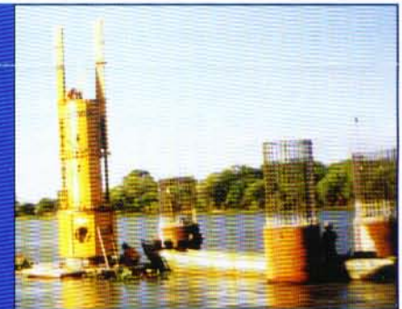
Dynamic Load Testing on drilled shaft over water, Brazil

GEOMEC, a PDA user from Brazil, commented on the load test over water using GRL's APPLE described on our last newsletter. GEOMEC noted that it had previously performed high strain dynamic tests on drilled shafts over water with its own 20 ton hammer (see photo). GEOMEC used its PDA to verify capacities of 2145 tons on this 1.6 m (5.3 ft) diameter, 45 m (148 ft) long drilled shaft over 25 m (82 ft) deep water. PDI is always happy to receive reports of such successful uses of its testing equipment.