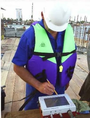
CSL testing with CHAMP in Brazil

A cable-stayed bridge supported by drilled shafts is currently under construction over the Potengi River that separates the cities of Natal and Redinha in northeastern Brazil. CSL was specified to assure the quality of the shafts. The first part of the testing program consisted of performing CSL on 12 drilled shafts that were 2 m (6.6 ft) in diameter and about 53 m (174 ft) in length. PDI Engenharia, who performed the tests, initially used the CHA-QX but later switched to the CHAMP and reported that traveling to the site and testing the shaft with the smaller instrument was much easier. The battery lasted all day and no additional power source was required.