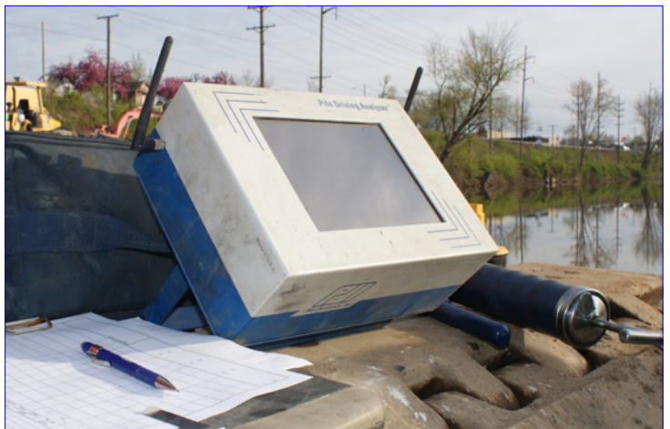
PDA model PAX running SiteLink™

Decades ago, a highly specialized engineer traveled from the field to the office, then spent hours at a computer interacting with the CAPWAP program. The final report could take several days. As computers have become more powerful, the time required to complete the analysis has dramatically decreased. The CAPWAP software also has matured to the point where it offers the engineer a variety of automatic features that speed up the interactive analysis. This has encouraged many PDA engineers to perform CAPWAP signal matching on their laptops in the field, immediately following data acquisition.