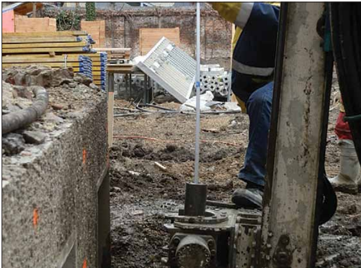
THERMAL WIRE cable installed in completed jet grouted column

Jet grouting is performed without the possibility of any visual inspection throughout the entire installation process. This makes quality control quite challenging: it is difficult to know with certainty the final diameter along the length of the jet grouted column.