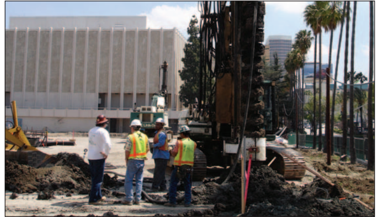
Los Angeles County Museum of Art