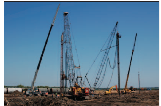
Sandow Unit 5 Power Plant

The next stop on our ACIP tour is in Rockdale, Texas, the site of the future Sandow Unit 5 Power Plant. This new coal fired power plant being built by Bechtel for TXU Energy will replace an older plant, significantly reducing plant emissions and thus contributing to the quality of the environment.