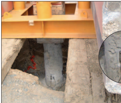
Brian Lara Cricket Academy – dynamic load test on ACIP pile.

Many flights take PDI technicians to sites that are interesting from a technical point of view. Occasionally, they take them to sites that appeal to the general public as well. Please join us on a virtual tour of a selected few: