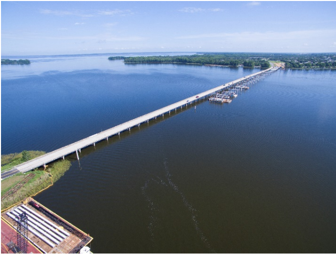
SR-19 during construction