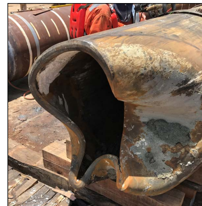
Figure 2. Extracted pile in Case 1, where upon encountering bedrock, eccentric stresses yielded one side of the pile.

42 in (1070mm) O.D. pipe piles were driven into a shallow hard gypsum rock layer on a 1:17 inclination suggesting the piles would experience eccentric forces once bedrock was encountered. All four foundation piles encountered refusal conditions at approximately 16 ft (5m) penetration and pile damage was observed on the first of the four piles driven.