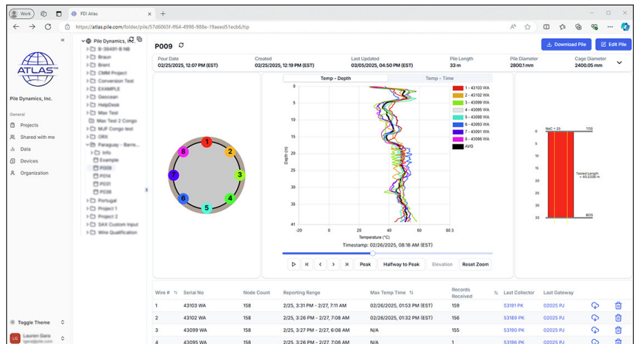
TIP data in ATLAS™ Secure Cloud