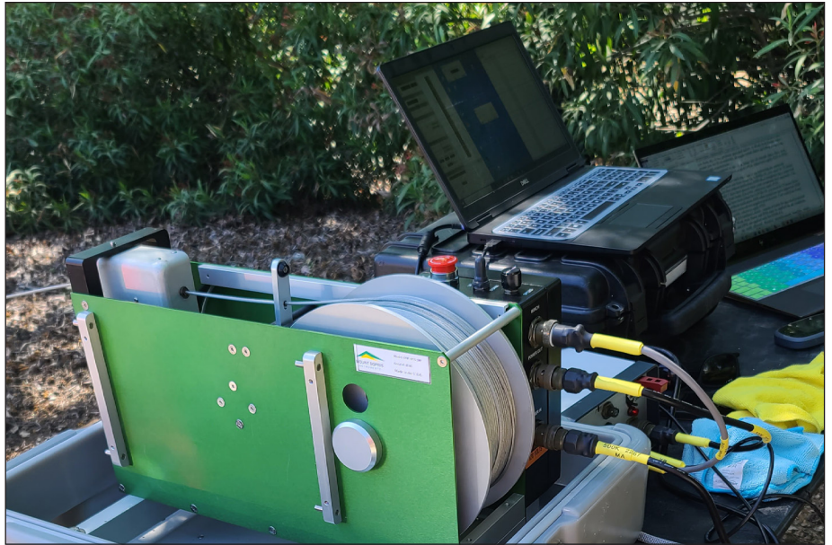
GGL system consisting of winch and data collection software

The GGL test probe houses a low-level radioactive source (Cesium-137) at the probe tip and a shielded detector located 15 inches away to assess the concrete density surrounding the access tubes or core holes. The 4 foot long GGL probe is lowered into each access tube using an electric winch. Gamma radiation counts in counts per second (CPS) are logged as the probe is raised at a typical rate of 10 feet per minute. GGL assesses the bulk density of the concrete from the center of the access tube outward for a radial distance of about three to four inches using the low energy source. Profiles of the average bulk density in pounds per cubic foot versus depth can they be presented based on calibration data.